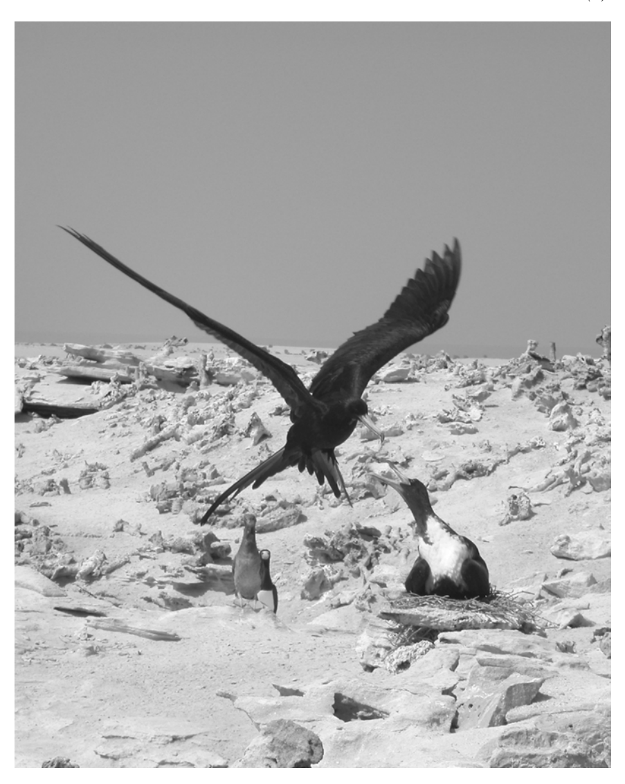
Male Magnificent Frigatebird landing near the nest on Ilhéu de Curral Velho Bij het nest landende man Amerikaanse Fregatvogel op Ilhéu de Curral Velho (P. López Suárez)