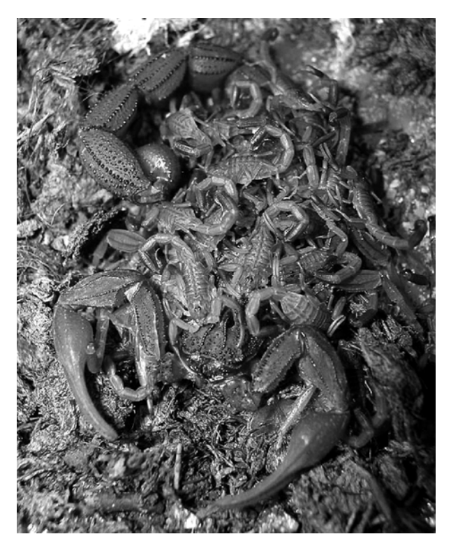
Fig. 1. Hottentotta caboverdensis , adult female A with offspring of brood 3.